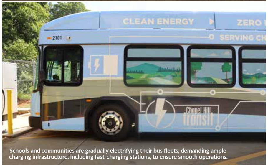
Schools and communities are gradually electrifying their bus fleets, demanding ample charging infrastructure, including fast-charging stations, to ensure smooth operations.

bike lanes and secure parking, which can deter potential users.