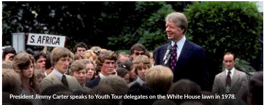
President Jimmy Carter speaks to Youth Tour delegates on the White House lawn in 1978.

When his schedule precluded speaking at an NRECA gathering once in