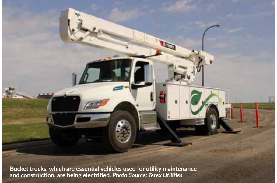
Bucket trucks, which are essential vehicles used for utility maintenance and construction, are being electrified.

However, there are several hurdles to e-bike adoption in rural areas. Many areas lack essential bicycle infrastructure, such as dedicated