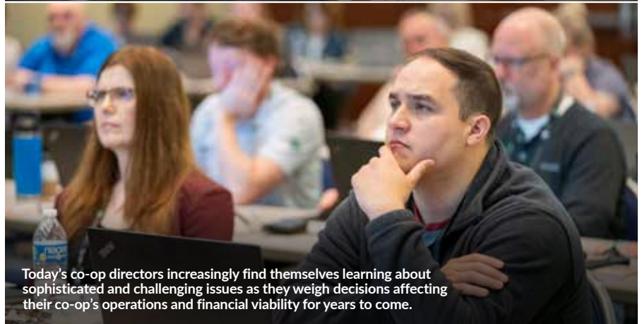
Today's co-op directors increasingly find themselves learning about sophisticated and challenging issues as they weigh decisions affecting their co-op's operations and financial viability for years to come.